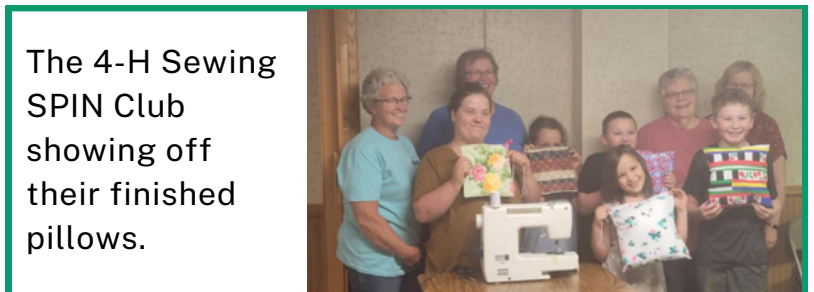
The 4-H Sewing SPIN Club showing off their finished pillows.